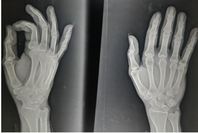
Fig 1a- oblique/spiral fracture of right 3 rd metacarpal