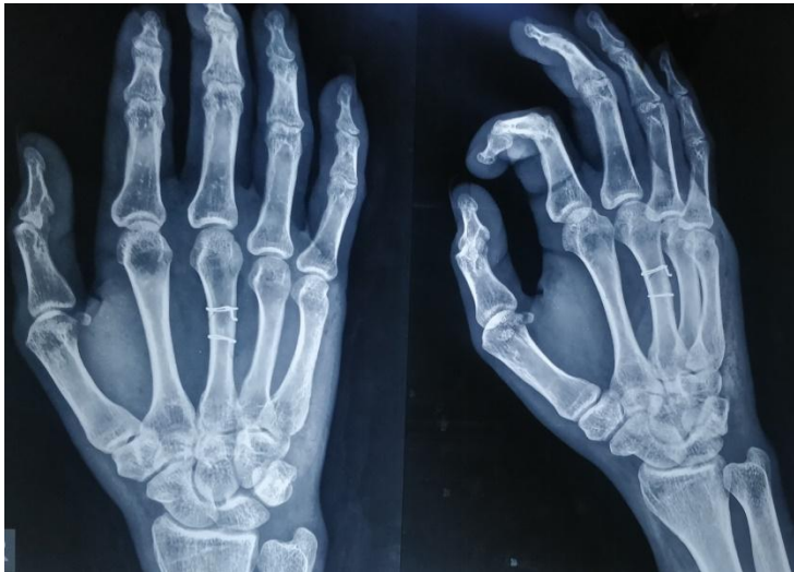
Fig 1b- post op x-ray, note the reduction achieved.